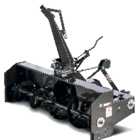
3 pt. snowblower