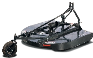
3 pt. rotary cutter