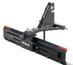
3 pt. angle blade