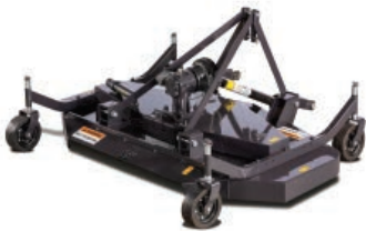
3 pt. finish mower