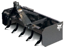
3 pt. box blade