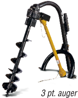
3 pt. auger