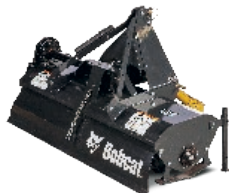
3 pt. tiller